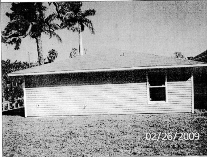
2-26-09; REAR VIEW