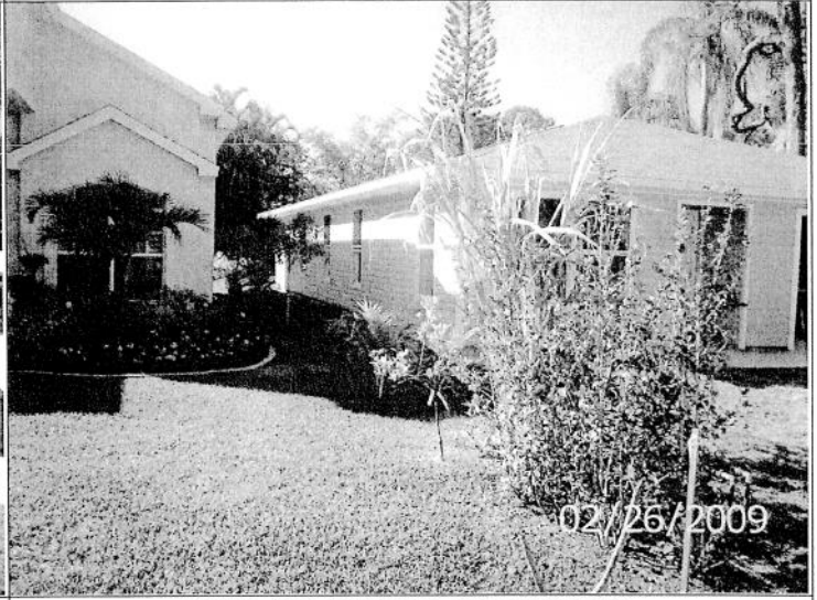
2-26-09; LEFT SIDE VIEW