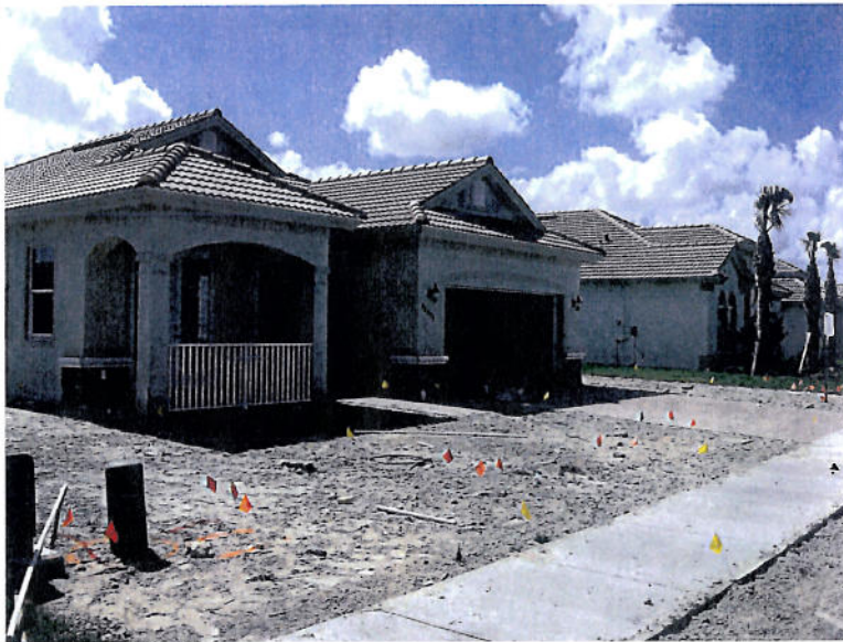
Front View 9/19/11

If using the Elevation Certificate to obtain NFIP flood insurance, affix at least two building photographs below according to the instructions for Item A6. Identify all photographs with: date taken; "Front View" and "Rear View"; and, if required, "Right Side View" and "Left Side View." If submitting more photographs than will fit on this page, use the Continuation Page, following.