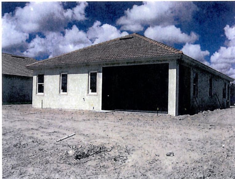
Rear View 9/19/11