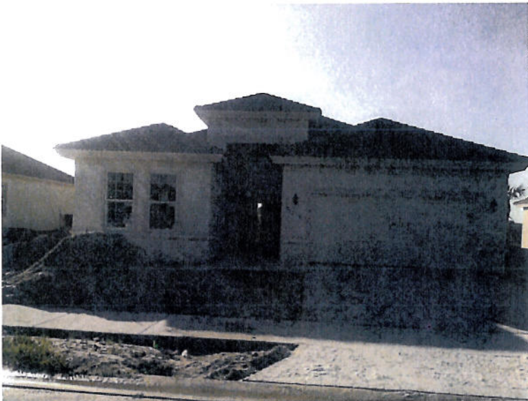
Front View 8/19/11

If using the Elevation Certificate to obtain NFIP flood insurance, affix at least two building photographs below according to the instructions for Item A6. Identify all photographs with: date taken; "Front View" and "Rear View"; and, if required, "Right Side View" and "Left Side View." If submitting more photographs than will fit on this page, use the Continuation Page, following.