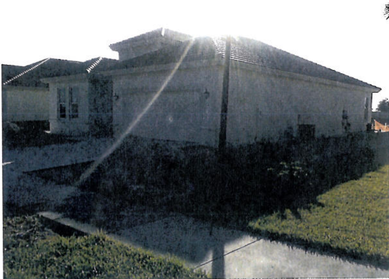
Side View 8/19/11

If submitting more photographs than will fit on the preceding page, affix the additional photographs below. Identify all photographs with: date taken; "Front View" and "Rear View"; and, if required, "Right Side View" and "Left Side View."