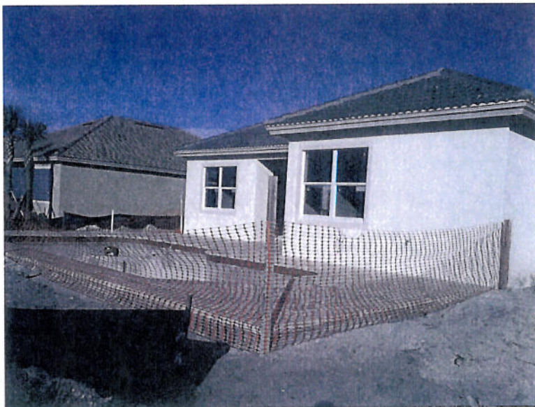
Rear View 8/19/11