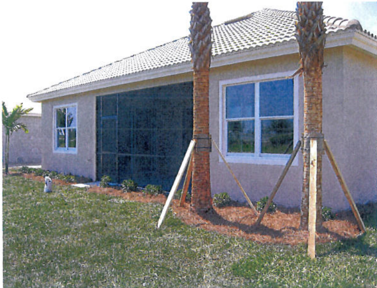
Rear View 04/06/11