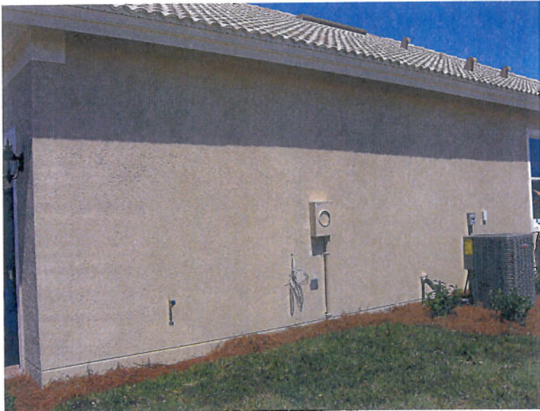
Side View 04/06/11

If submitting more photographs than will fit on the preceding page, affix the additional photographs below. Identify all photographs with: date taken; "Front View" and "Rear View"; and, if required, "Right Side View" and "Left Side View."