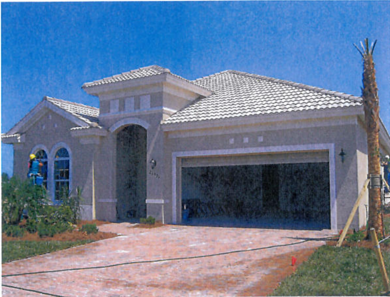
Front View 04/06/11

If using the Elevation Certificate to obtain NFIP flood insurance, affix at least two building photographs below according to the instructions for Item A6. Identify all photographs with: date taken, "Front View" and "Rear View"; and, if required, "Right Side View" and "Left Side View." If submitting more photographs than will fit on this page, use the Continuation Page, following.