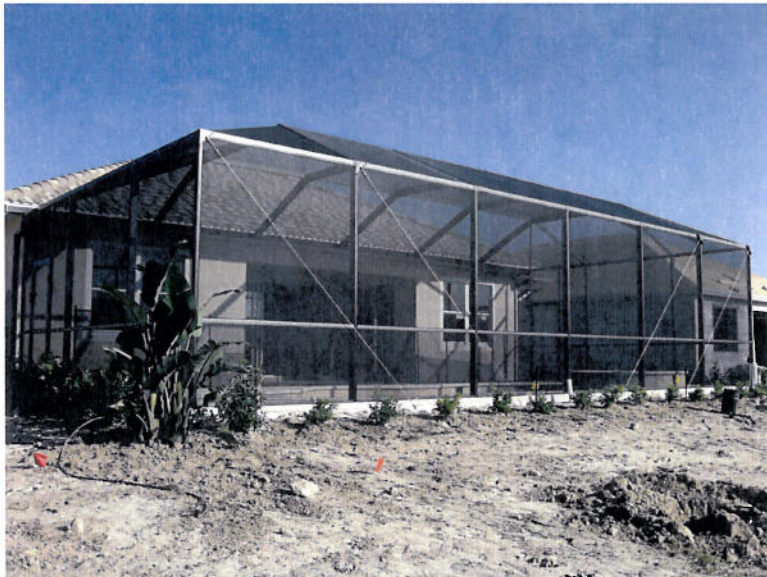
Rear View 9/13/11