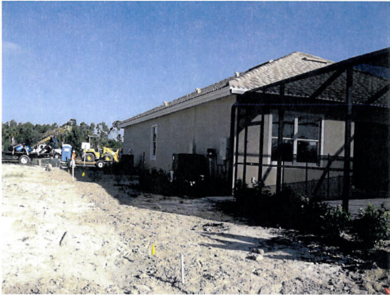
Side View 9/13/11

If submitting more photographs than will fit on the preceding page, affix the additional photographs below. Identify all photographs with: date taken; "Front View" and "Rear View"; and, if required, "Right Side View" and "Left Side View."