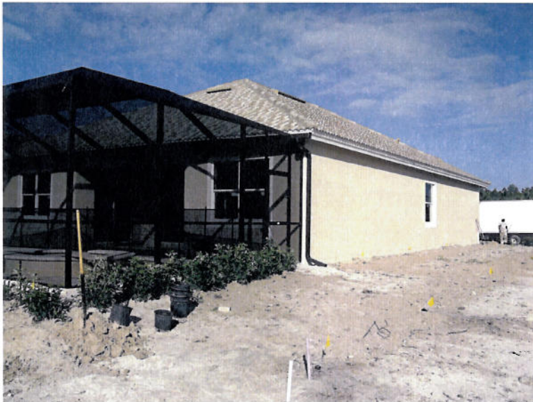
Side View 9/13/11