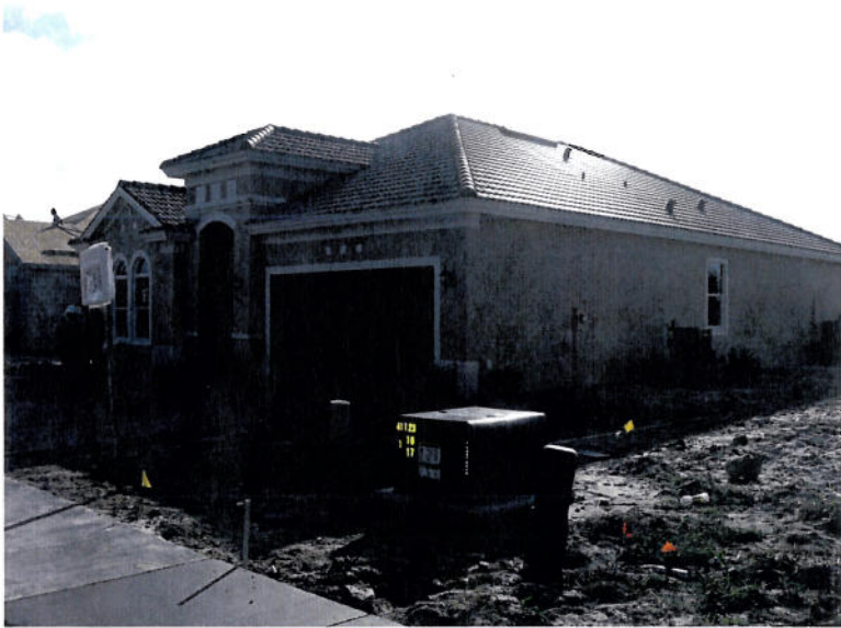
Front View 9/13/11

If using the Elevation Certificate to obtain NFIP flood insurance, affix at least two building photographs below according to the instructions for Item A6. Identify all photographs with: date taken; "Front View" and "Rear View"; and, if required, "Right Side View" and "Left Side View." If submitting more photographs than will fit on this page, use the Continuation Page, following.