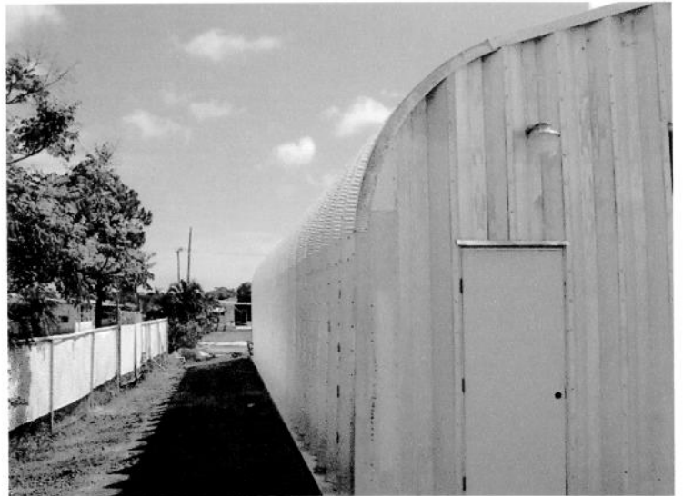
Left Side View (from front)