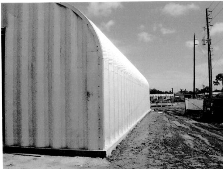
Right Side View (from front)