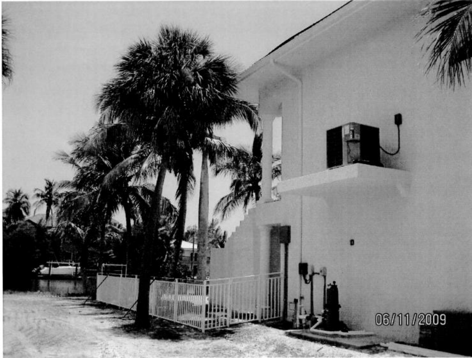
AIR CONDITIONER SLAB 6/11/2009

If submitting more photographs than will fit on the preceding page, affix the additional photographs below. Identify all photographs with: date taken; "Front View" and "Rear View"; and, if required, "Right Side View" and "Left Side View."