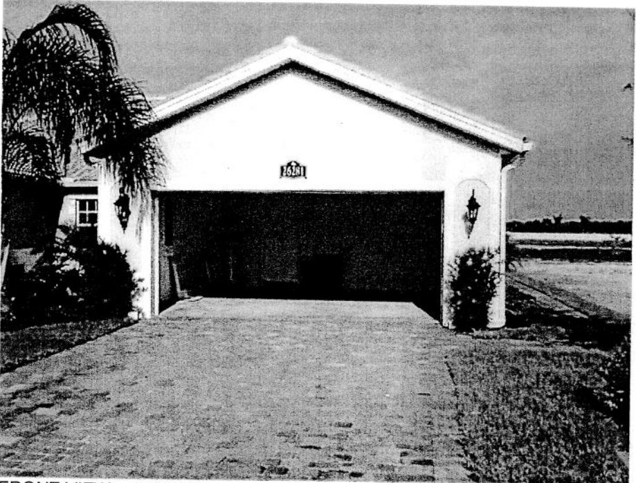
FRONT VIEW – 05/25/09