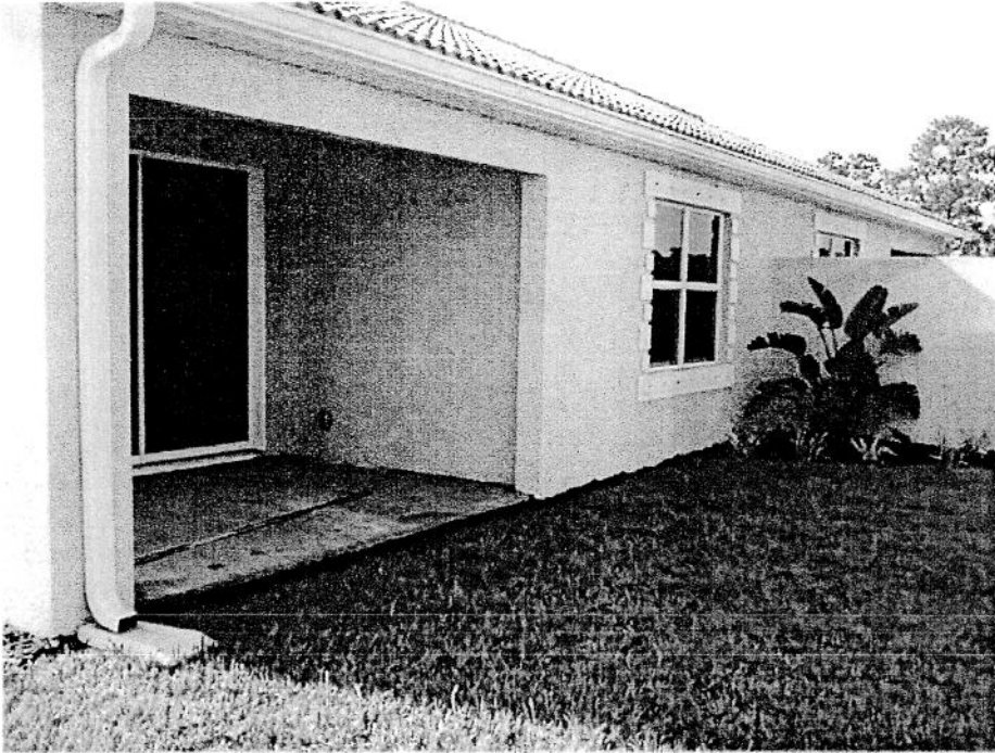
REAR VIEW - 05/25/09

If submitting more photographs than will fit on the preceding page, affix the additional photographs below. Identify all photographs with: date taken; "Front View" and "Rear View"; and, if required, "Right Side View" and "Left Side View."