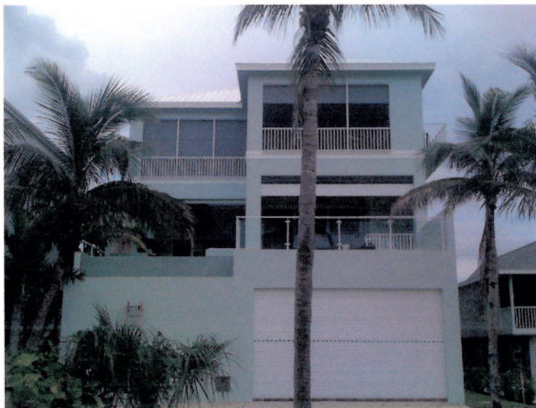
REAR VIEW DATE TAKEN: 08/11/11