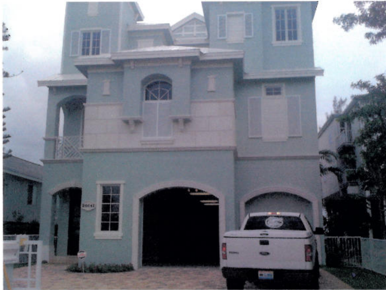
FRONT VIEW DATE TAKEN: 08/11/11

If using the Elevation Certificate to obtain NFIP flood insurance, affix at least two building photographs below according to the instructions for Item A6. Identify all photographs with: date taken; "Front View" and "Rear View"; and, if required, "Right Side View" and "Left Side View." If submitting more photographs than will fit on this page, use the Continuation Page on the reverse.