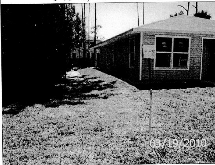
3-19-10; LEFT SIDE VIEW