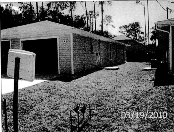
3-19-10; RIGHT SIDE VIEW