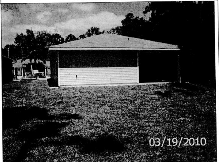
3-19-10; REAR VIEW