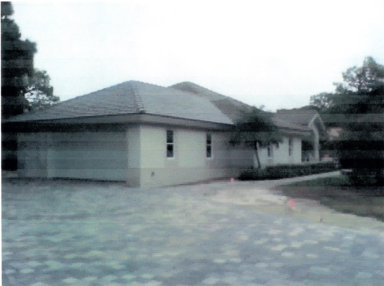
FRONT VIEW 10/31/11