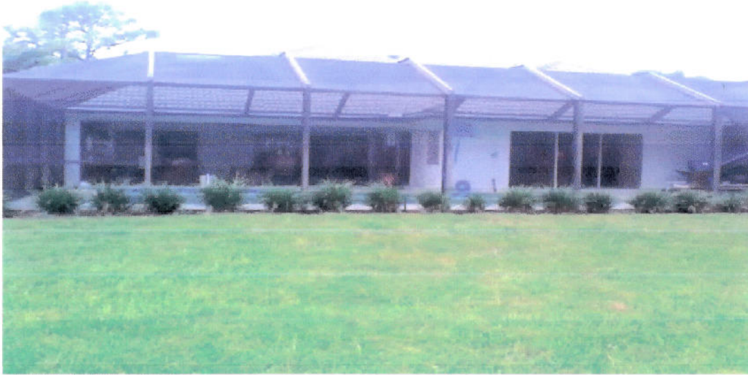
REAR VIEW 10-31-11